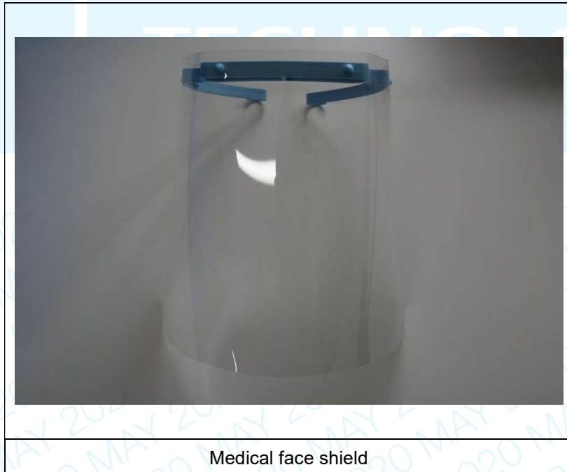
Medical face shield